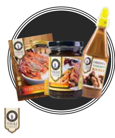
FOOD SPECIALIZE CO., LTD.