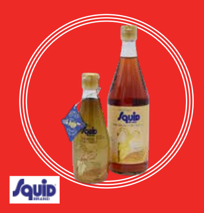
THAI FISHSAUCE FACTORY (SQUID BRAND) CO., LTD.