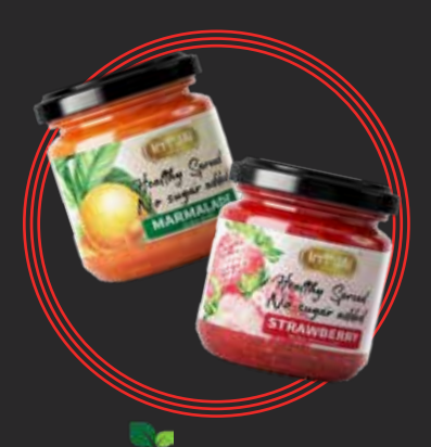
108 FOODS CO., LTD.

We begin to develop jams from local fruits using food innovation, providing value to customers with different flavors, no added sugar, and low sodium. We prioritize purchasing selected tropical and organic fruits from farmers at a price higher than the market, adhering to the "Thai jam from local to global" concept, with the aim of preserving jobs and assisting local farmers.