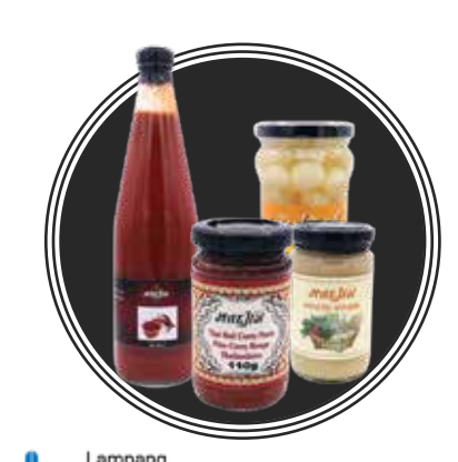
LAMPANG FOOD PRODUCTS CO., LTD.

Thai hot chili sauce, Thai seafood sauce, Thai sweet chili sauce.