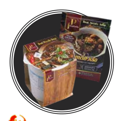
FOOD MART (THAILAND) CO., LTD.

We are now manufacturing "innovative food," which includes plant-based food as well as healthy ready-to-cook and ready-to-eat meals.