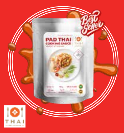
THAI DELICIOUS FOOD INTERNATIONAL CO., LTD.