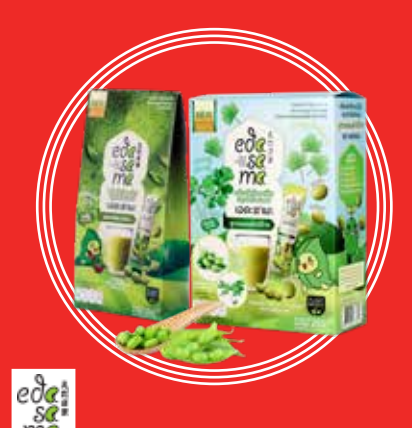
EDASAMA CO., LTD.

lated Sugar, Refine Sugar, Grade 3 White Sugar.