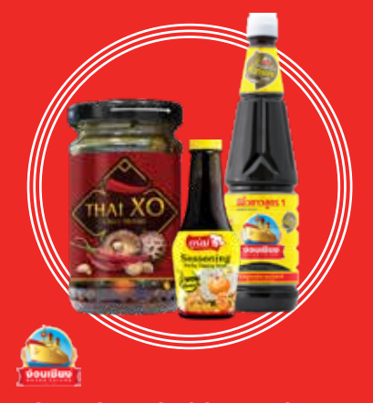
NGUAN CHIANG FOOD INDUSTRY CO., LTD.

Brown label cooking sauce, Dark soy sauce formula 1, Dark soy sauce formula 2, Dark soy sauce orange