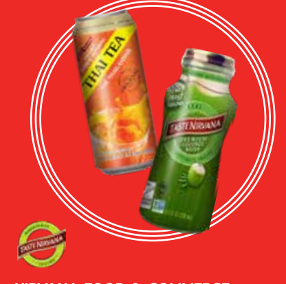
NIRVANA FOOD & COMMERCE INTERNATIONAL CO., LTD.

Spicy basil sauce/Deeone, Chilli garlic sauce/Deeone,