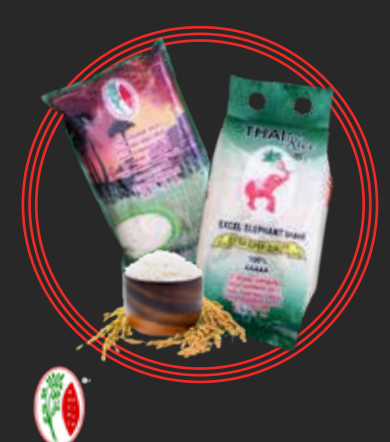
EXCEL RICE & PRODUCTS CO., LTD.