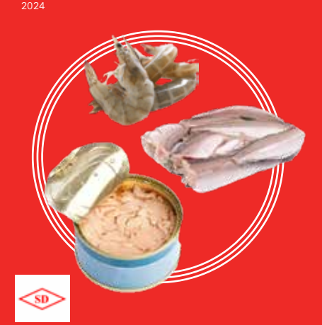
S & D MARINE PRODUCTS CO., LTD.

white shrimp pre-fried shrimp, frozen Thailand headless peeled deveined tail-off white shrimp.