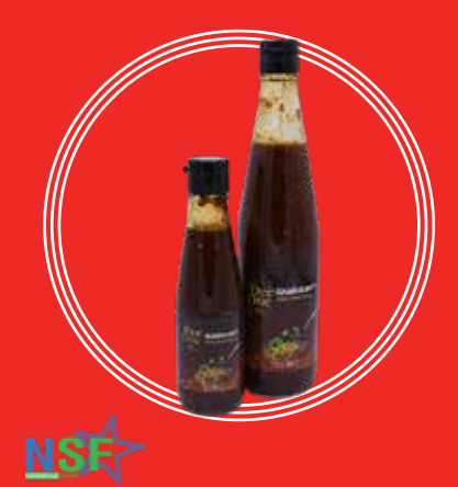
NINE STAR FOOD CO., LTD.