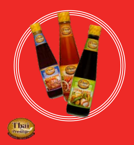
THAI PREEDA TRADING CO., LTD.

Website: thaideliciousfood.com E-mail: info@thaideliciousfood.com Tel: +66 2042 4884