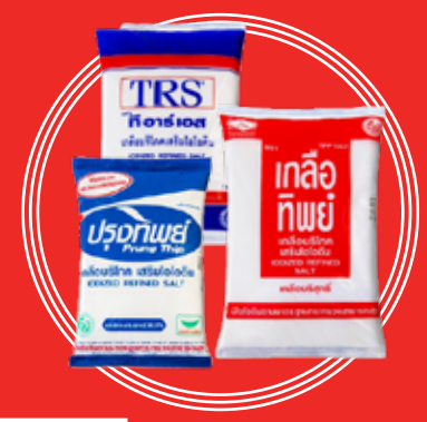
THAI REFINED SALT CO., LTD.

Iodized refined salt, Non-anticaking refined salt, Pool